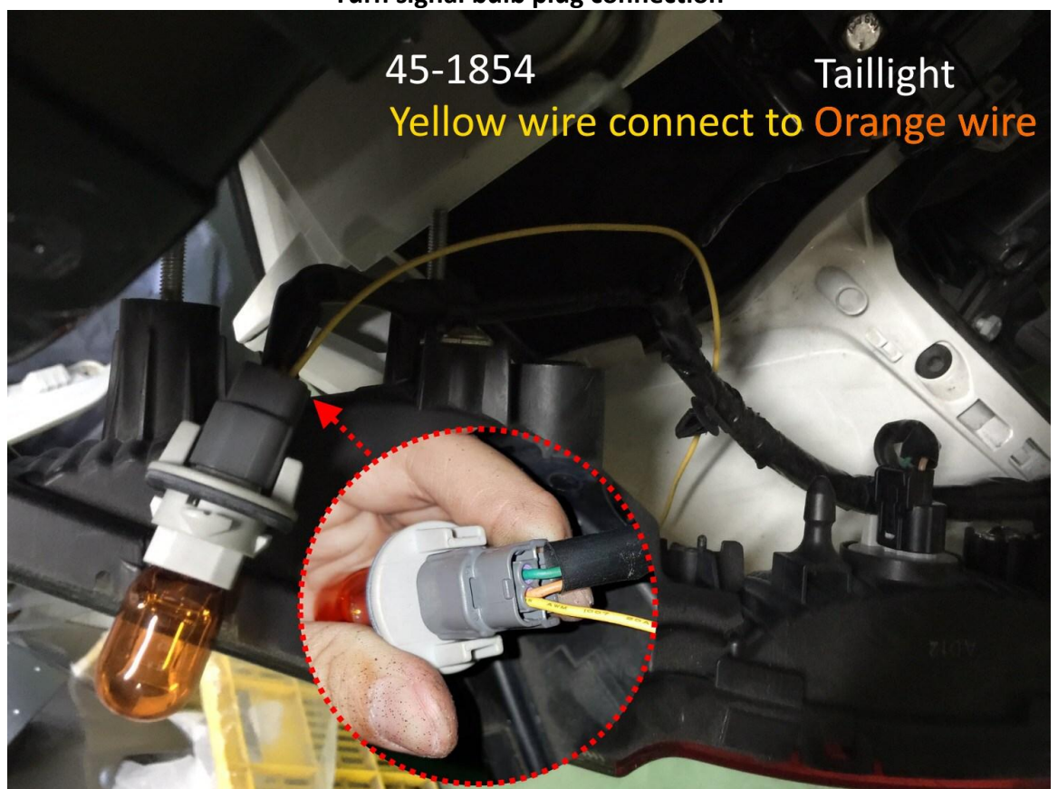
Page 3 of 4